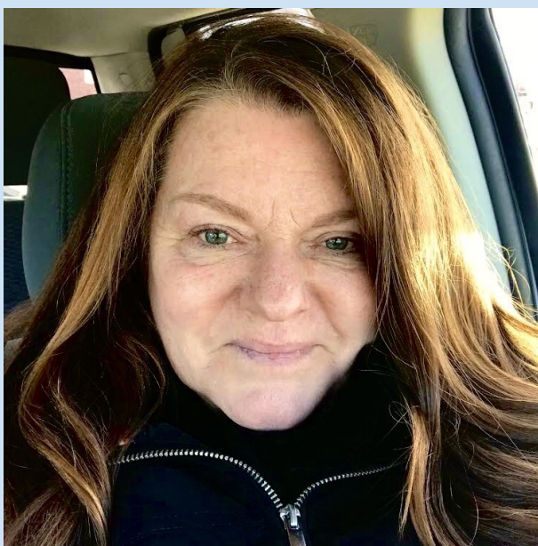
Teacher, French & Dean of Students