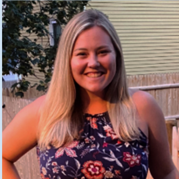
Teacher, Spanish & Dean of Students

B.A. Spanish concentration in Secondary Education from Keene State College